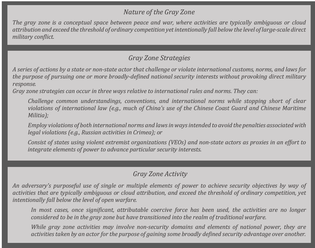
Figure 2: SMA Gray Zone Definition

capabilities can be addressed, therefore, a consensus definition of the gray zone, specific enough to guide further work in this area, is required.